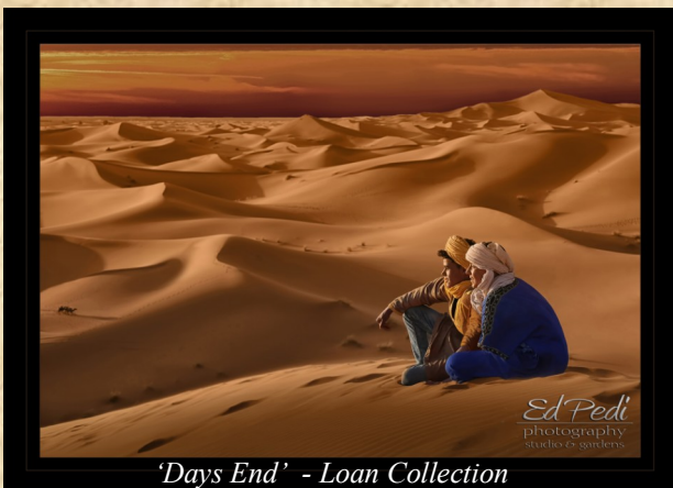
'Days End' - Loan Collection